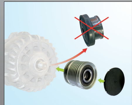
Fig. 3: Replacement procedure