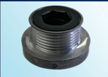
Fig. 1: Alternator Belt Pulley 77 00 110 616

Should the alternator belt pulley be defective (OE ref. 77 00 110 616), it is to be replaced by an overrunning alternator pulley. The overrunning alternator pulley is available with RUVILLE No. 55627.